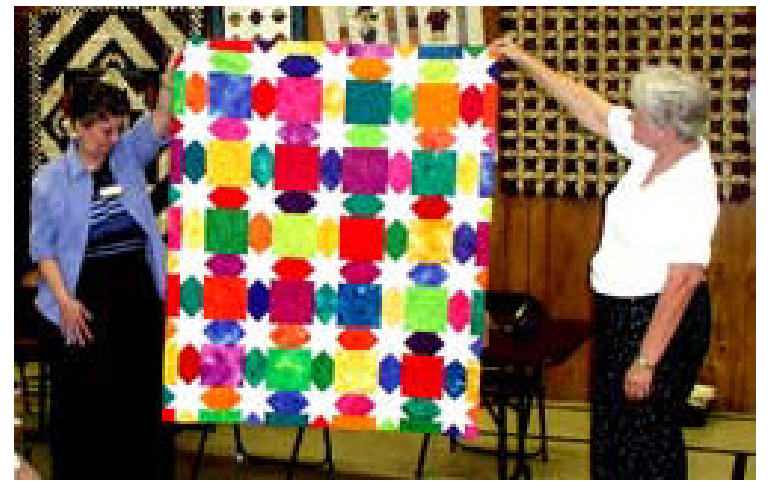
I goofed and didn't get the maker's name for this one! In person it is a starry burst of color!